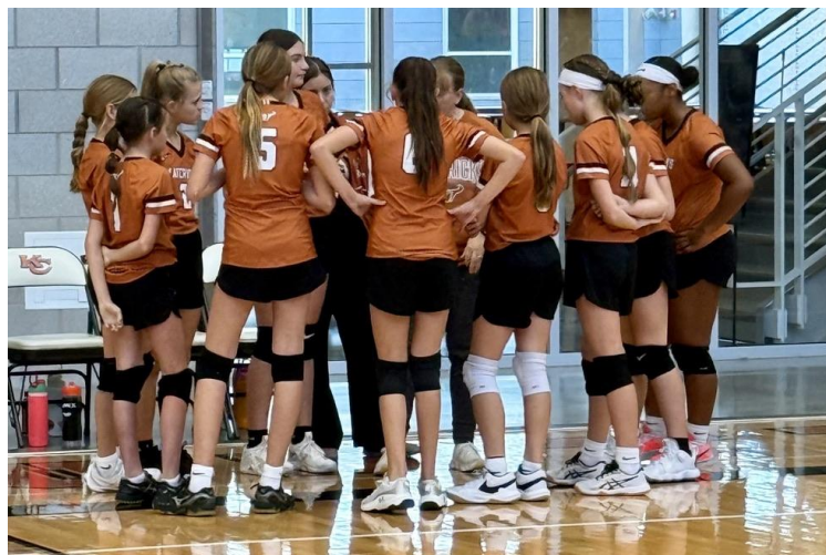
Lady Mavs huddle up to figure out a game plan.

A Team (L): 17-25, 25-22, 16-25 KC 17 Md 25 KC 25 Md 22 KC 16 Md 25