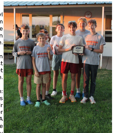
Bottom: The KCJH boys team holding their plaque after winning the SPIAA Junior High League Cross Country meet.