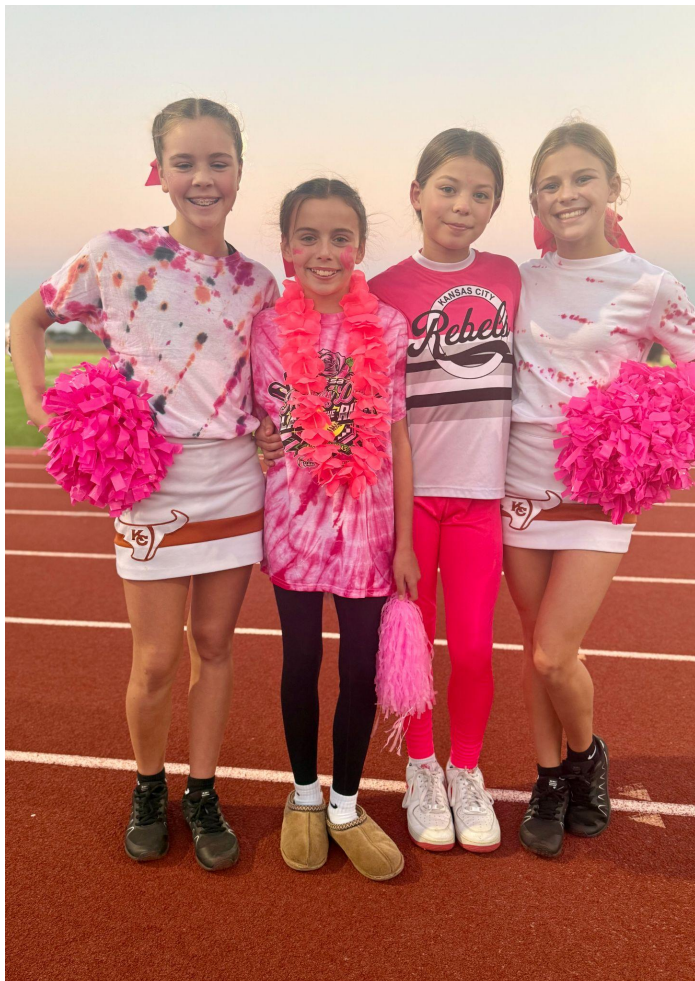
Bottom left: Sibling standing strong for Pink night.